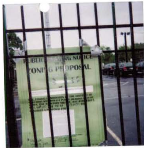
5-12-08 200 Block of 3 rd St SE