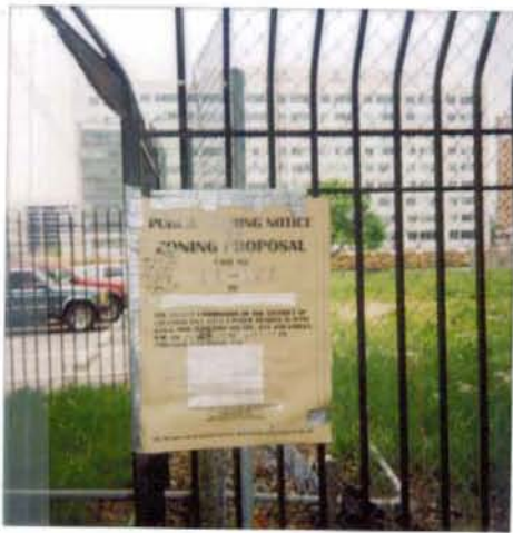
5-19-08 replaced 200 Bk. of 3 rd St SE