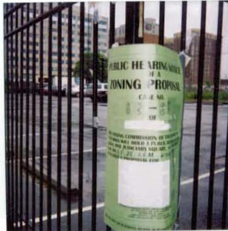
250 M st SE replaced 5-23-08