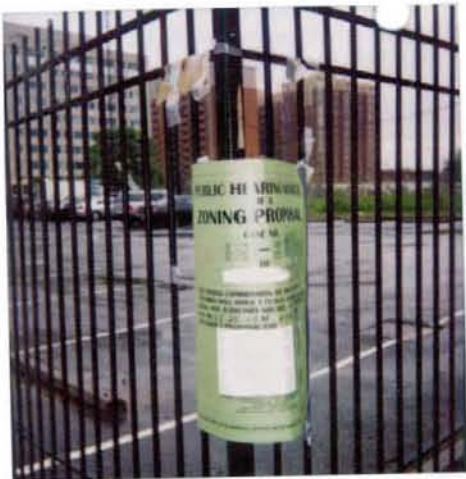
4-22-08 Replaced 250 M st SE