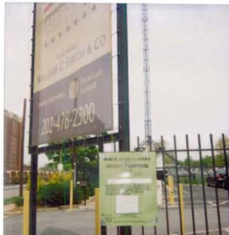
5-23-08 Replaced 250 M st SE